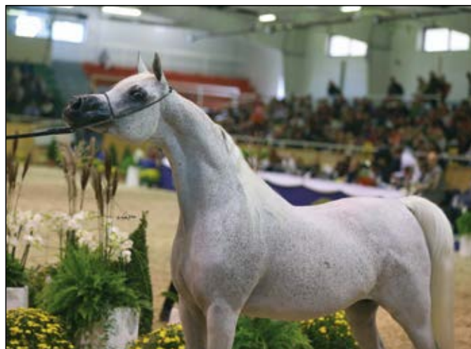
Emandoria (Gazal Al Shaqab x Emanda) - Aachen 2013