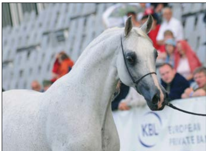
Egzonera (Monogramm x Egzotyka)