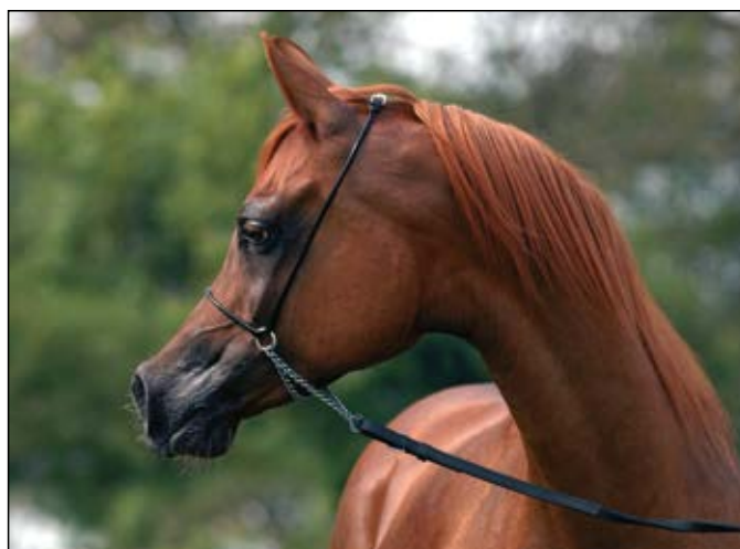
Emocja (Monogramm x Emigracja)