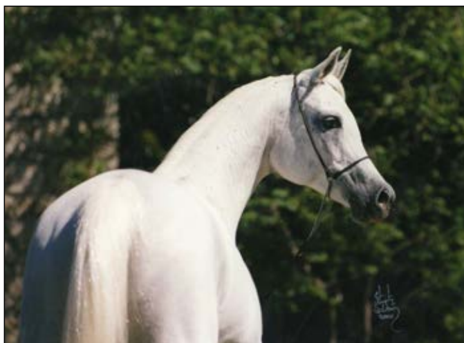
Emanacja (Eukaliptus x Emigracja)