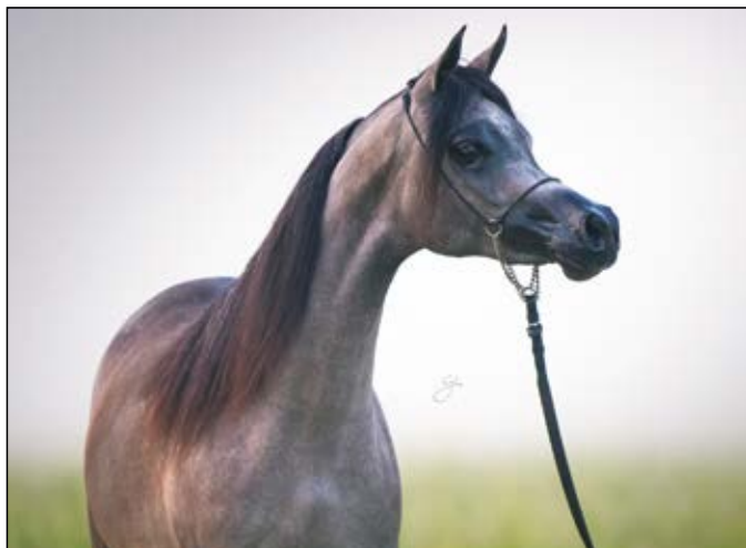
El Madera (Morion x El Medonia)