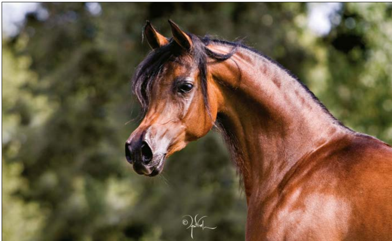
Pianissima (Gazal Al Shaqab x Pianosa)

enough to mention that only in 2000 he became Polish National Champion, All Nations Cup Champion, European and World Champion Senior Stallion. In 2008, EKSTERN was also awarded with the WAHO trophy for remarkable representatives of the Arabian breed, a well-deserved and adequate trophy for such a superb stallion.