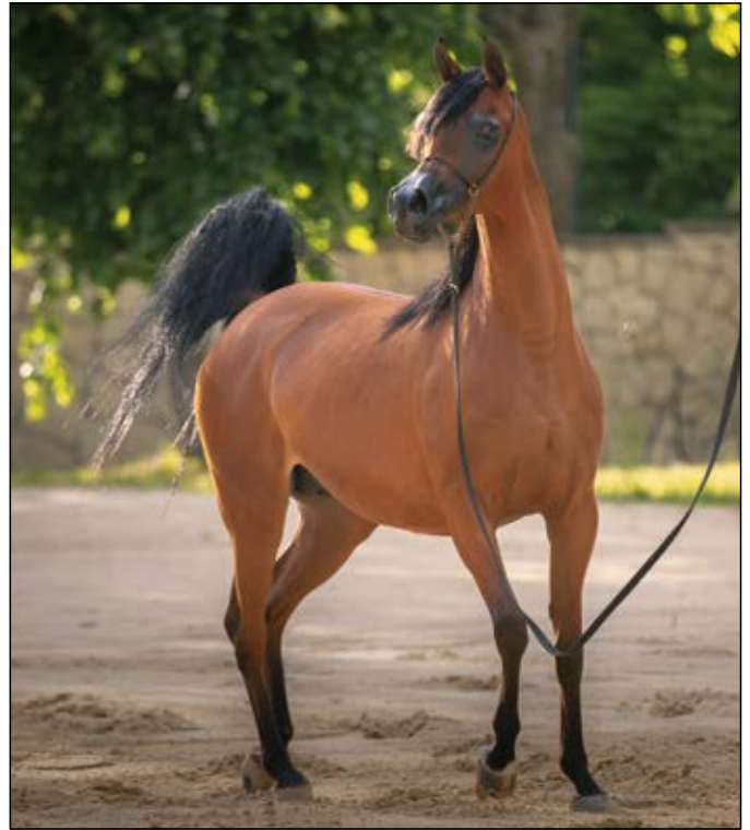
Esmeraldia (QR Marc x Emandoria)