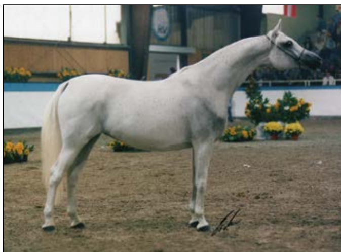
Emanacja (Eukaliptus x Emigracja) - Aachen 1998