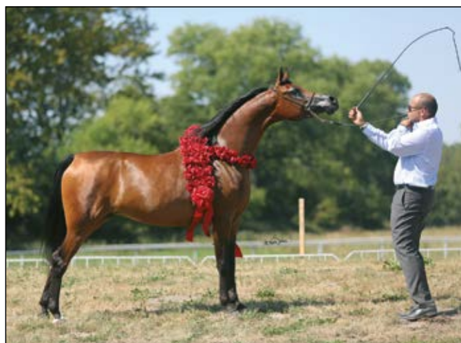
Piniata (Eden C x Pinga) - Polish Nationals 2015