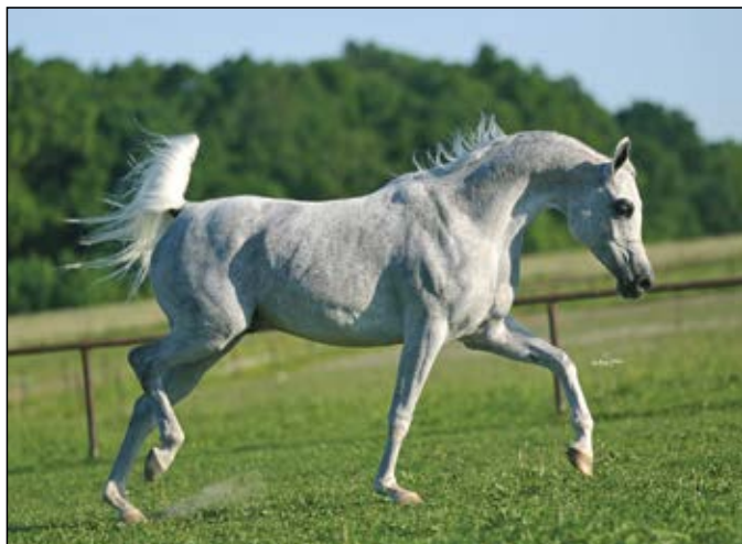
Perfirka (Gazal Al Shaqab x Perforacja)