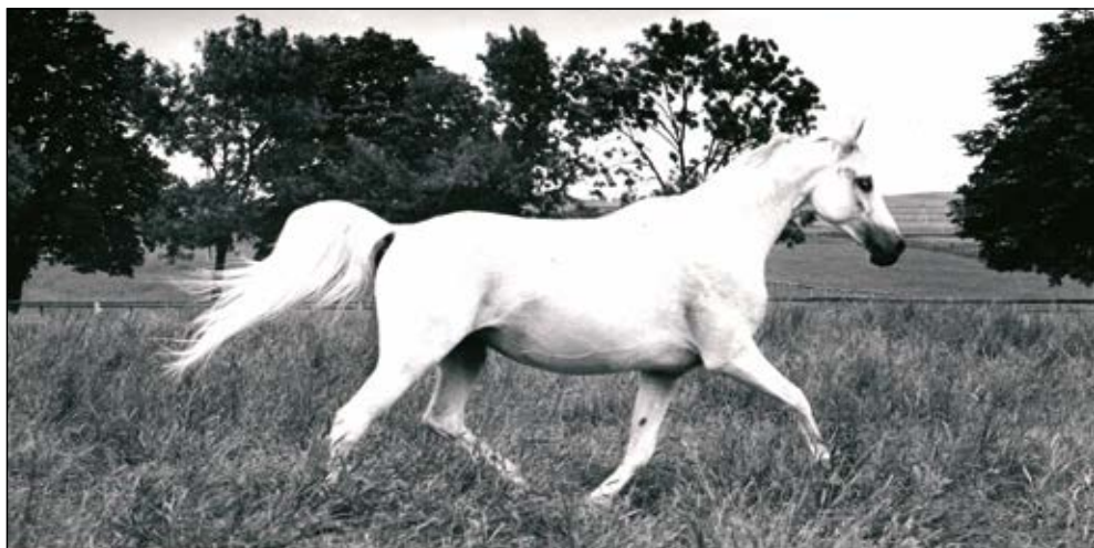
Estebna (Nabor x Estokada)