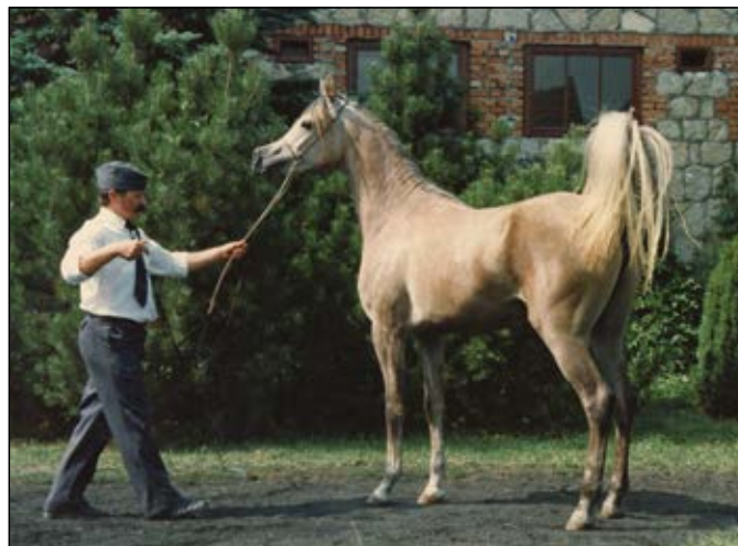
Estarta (Gadir x Estancja)