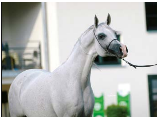
Emmona (Monogramm x Emilda)