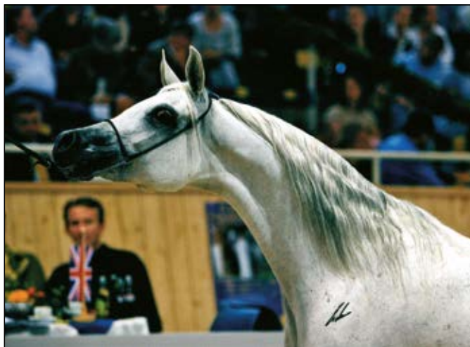
Embra (Monogramm x Emilda) Aachen 2006