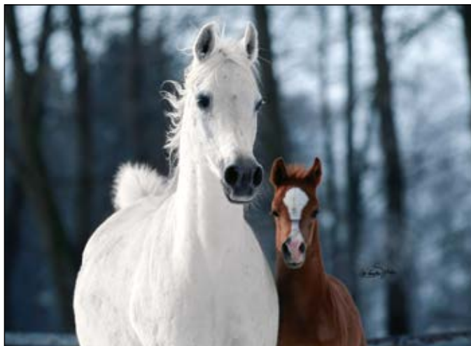
Palmeta (Ecaho x Pilica)