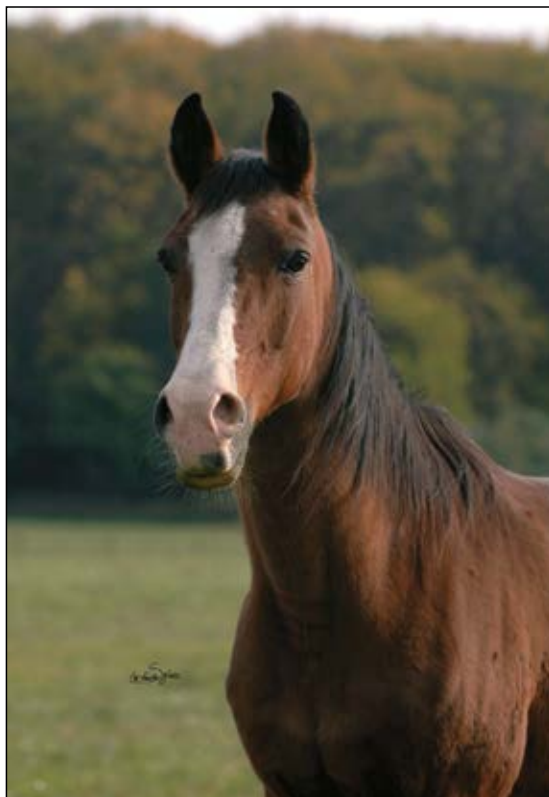
Pentoza at the age of 28