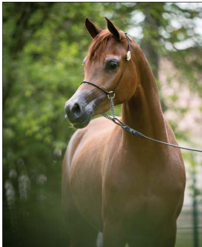
El Bellisima (Ascot DD x Ekliptyka)