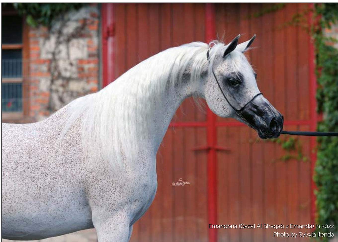
Emandoria (Gazal Al Shaqab x Emanda) in 2022