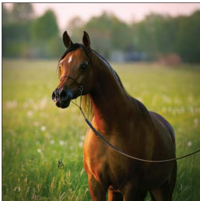
Ejrene (Gazal Al Shaqab x Emocja)