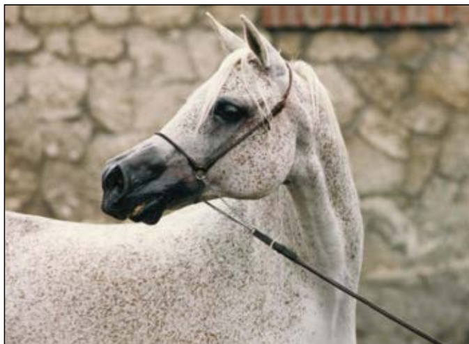
Emigracja (Palas x Emisja)