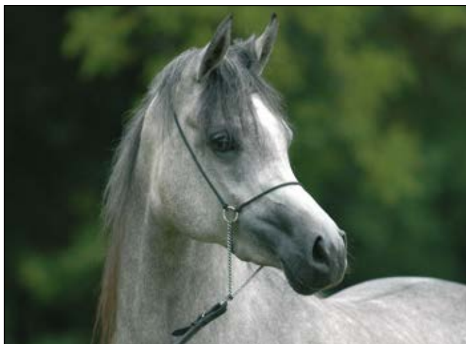
Emandoria as a two-year-old in Białka