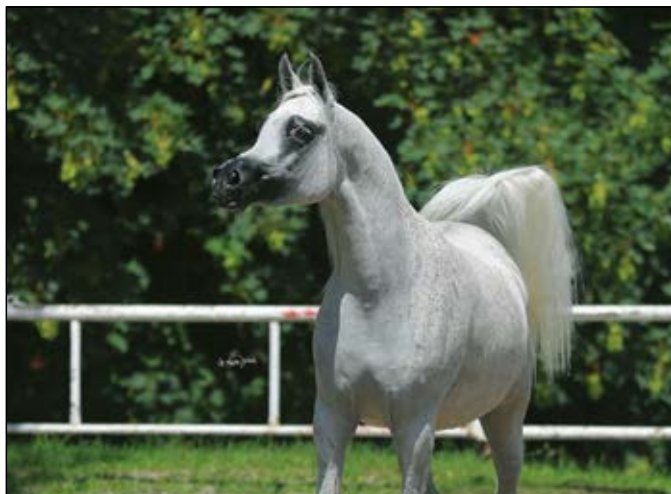
El Medonia (Shanghai EA x El Medina)