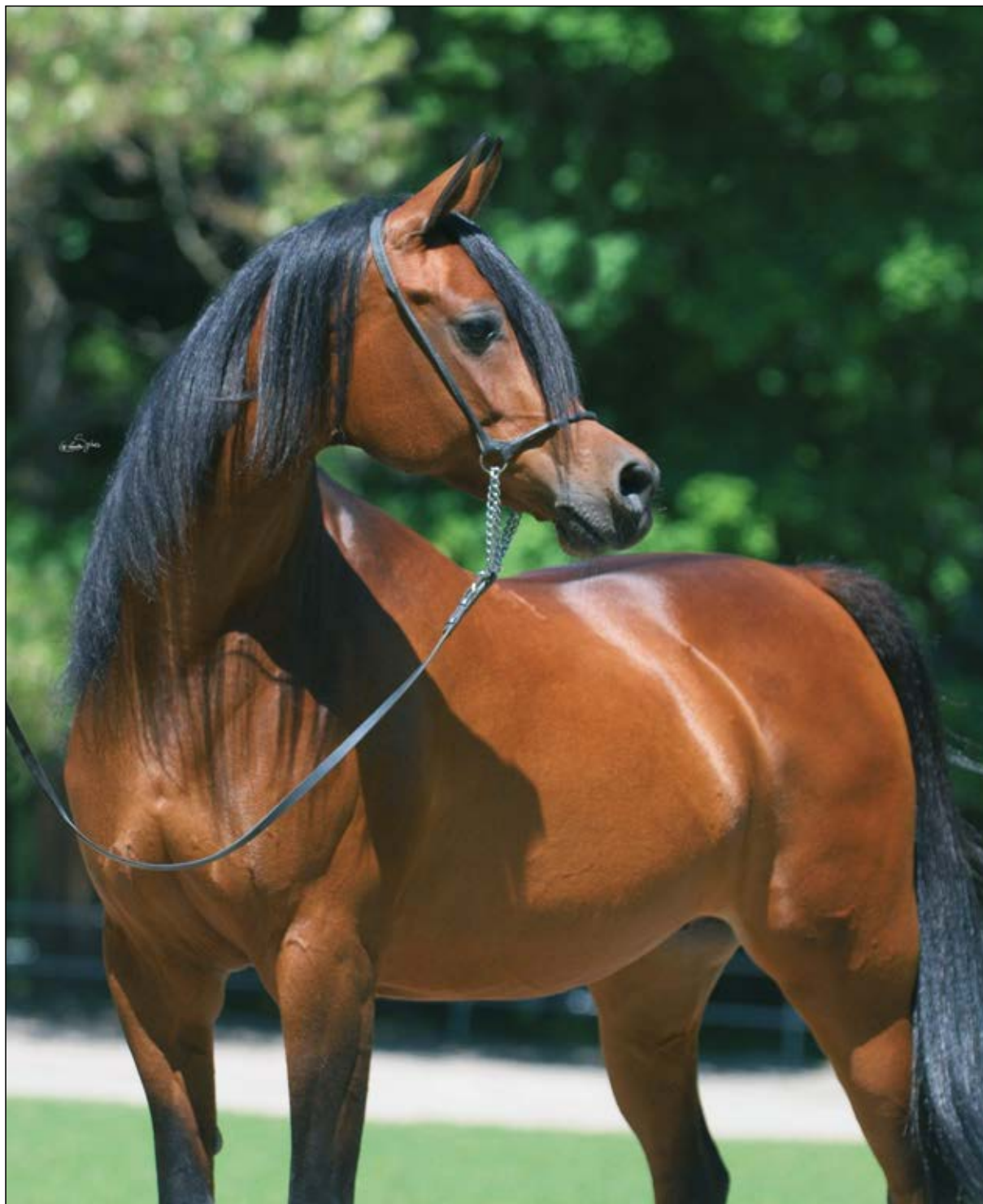
Pianissima (Gazal Al Shaqab x Pianosa)