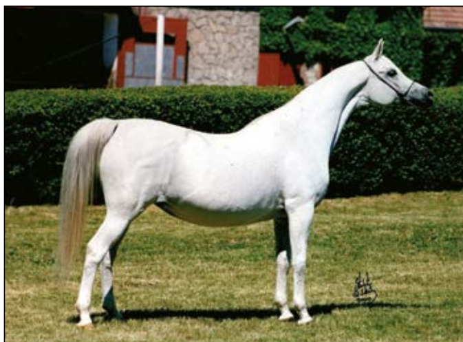
Emigrantka (Eukaliptus x Emigracja)