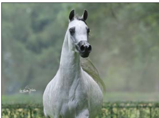
Pascuala (Ascot DD x Palmeta)