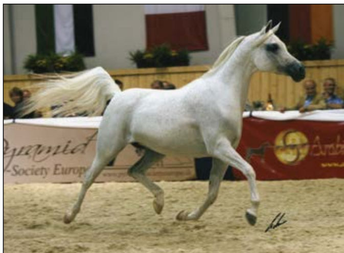
El Dorada (Sanadik El Shaklan x Emigrantka) - Aachen 2007