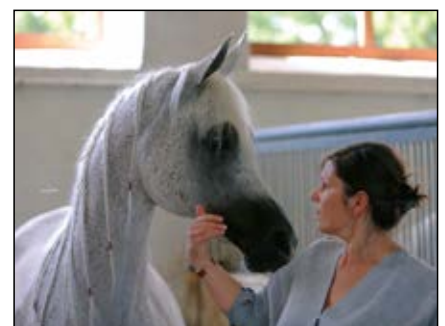
Author of the article with one of the most decorated mares of our times - Emandoria

bred by Janów Podlaski, Michałów and Białka Stud to a large extent have shaped the Arabian horse as we know it today. Therefore, it is of utmost importance to preserve this priceless heritage and to protect the bewitching beauty of the Polish mares that reaches beyond borders. To be continued... ♦