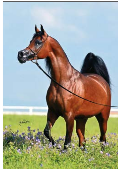
Emandilla (Om El Shahmaan x Espadrilla)

daughter, EMANDORELLA 2012, the dam of EMARELLA 2018 (by Sahm El Arab 2013), 2021 Qatari National Gold Champion Junior Filly, or the full sister to EMERALD J, ESMERALDIA 2013, the dam of EL ESMERA 2018 (also by Sahm El Arab), 2021 European Gold Champion Junior Filly, just recently crowned 2022 Polish National Gold Champion Senior Mare and Best in Show in Janów Podlaski. These two sensational young mares are the sixth generation of the champion making family, started by EMIGRACJA. While only considering numbers, EMANDA mostly produced stallions that played a minimal role in breeding, however when she produced a mare, the result was no less than spectacular. Her