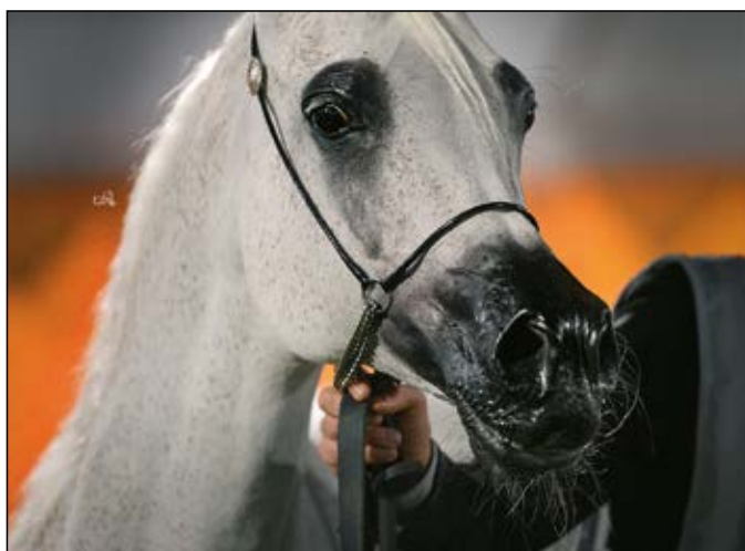
Pepita (Ekstern x Pepesza)