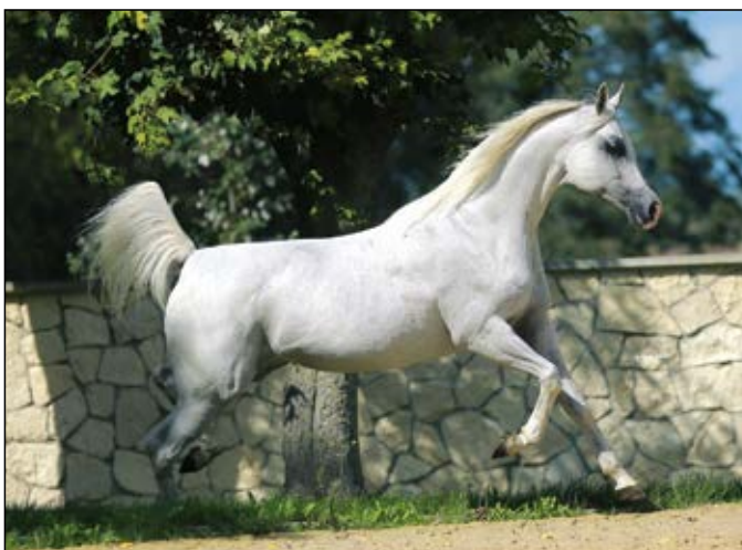
Emmona (Monogramm x Emilda)