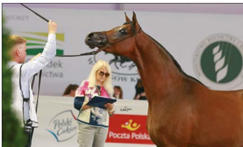
Petula (Kahil Al Shaqab x Pinga)

the 2001 World Champion Stallion, GAZAL AL SHAQAB, and a great-granddaughter of the 1983 World Champion Mare, PILARKA. PINGA's dam, PILAR 1996, was the highest selling horse of the 2010 Pride of Poland auction, fetching the price of 240 000 EUR from the Qatari Al Shaqab Stud, the owner of GAZAL AL SHAQAB as well as the whole dynasty of sires stemming from this superb stallion. As a yearling filly, after a quick warm-up at the local Polish shows in Falborek and Betzyce, PINGA became