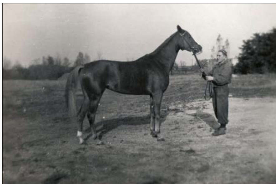
ESTOKADA 1951 (Amurath Sahib x Saga)

The meritorious dam line of MILORDKA, better known as the champion producing 'E' line, is one of the most numerous and highly valued Arabian families not only in Poland but also in the world. Originated in 1810 in the Princes Sanguszko's Stud of Sławuta, the family is nowadays represented mainly in Michałów State Stud and it has become their trademark in the recent years. The snow-white or flea-bitten, and more recently also bay, representatives of 'E' line have been among the most sought-after broodmares in the world due to their extreme femininity,