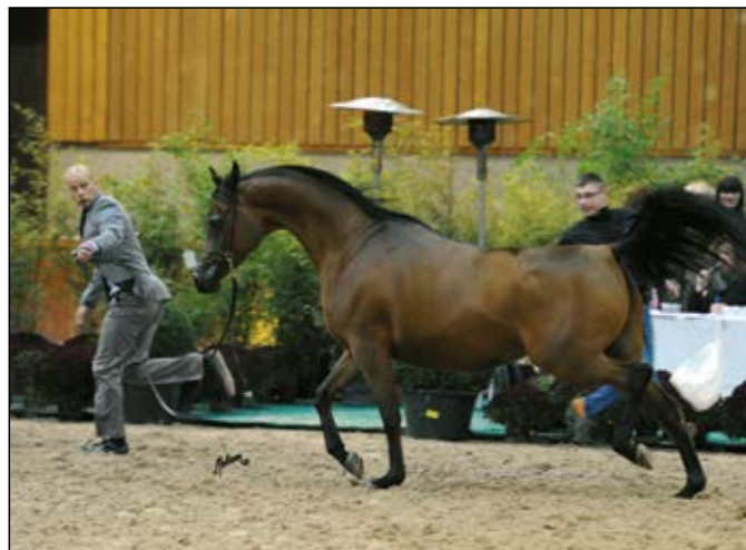
Pinga (Gazal Al Shaqab x Pilar) - Moorsele 2012