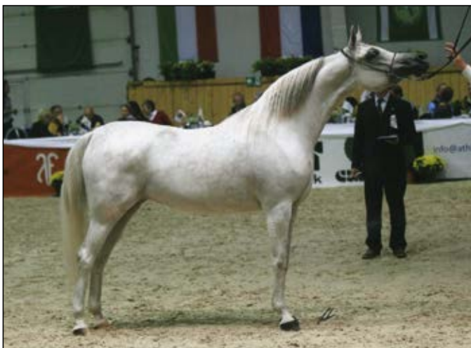
El Saghira (Galba x Emira) - Aachen 2012