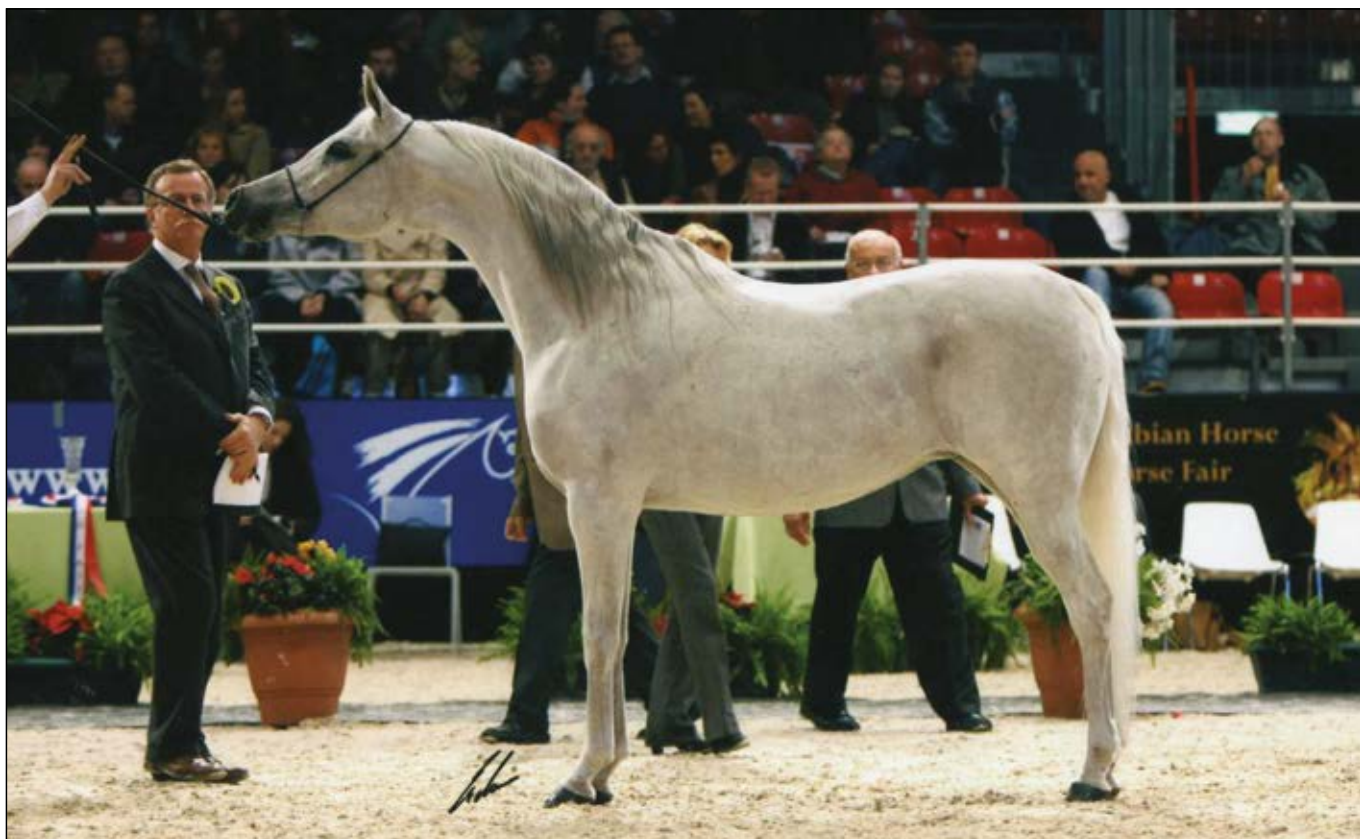
Embra (Monogramm x Emilda) Paris 2006

EMMONA followed in her dam's footsteps, joining the broodmare band of Halsdon Arabians. Shirley and Charlie Watts paid 45 000 EUR for the then 19-year-old mare whose most renowned progeny is the dark bay GAZAL AL SHAQAB 1995 son, ERYKS 2003. EMILDA's full sister, EMANTA 1991, sold to Falborek Arabians for the then record price on the Polish market – 70 000 USD, produced one of the most beautiful mares ever bred by the Polish private breeders, the exquisite grey EKSTERN 1994 daughter, EKSTERNA 2005, the dam of 2020 Polish National Gold Champion Senior Stallion, EMPOWER 2015 (by WH Justice 1999). What is more, EMANACJA produced valuable