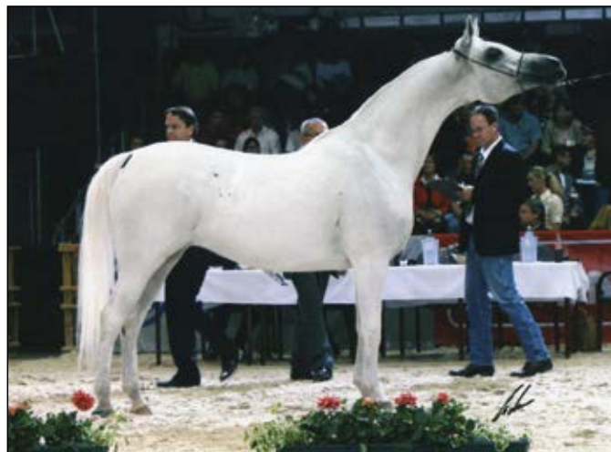
Emanda (Ecaho x Emanacja)