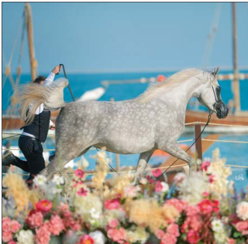
Emarella (Sahm El Arab x Emandorella)