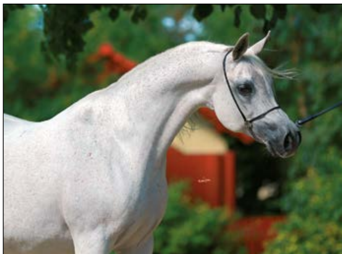
Espadrilla (Monogramm x Emanacja)