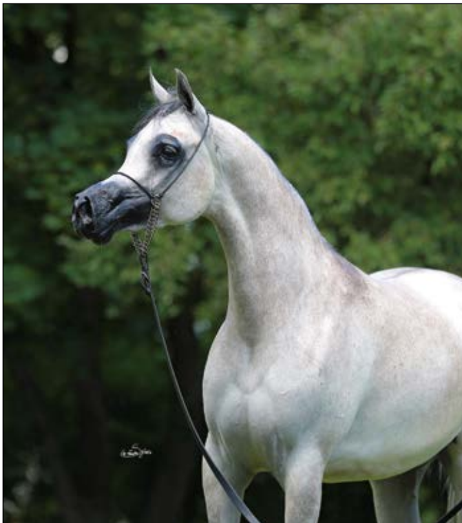
El Medida (Morion x El Medara)