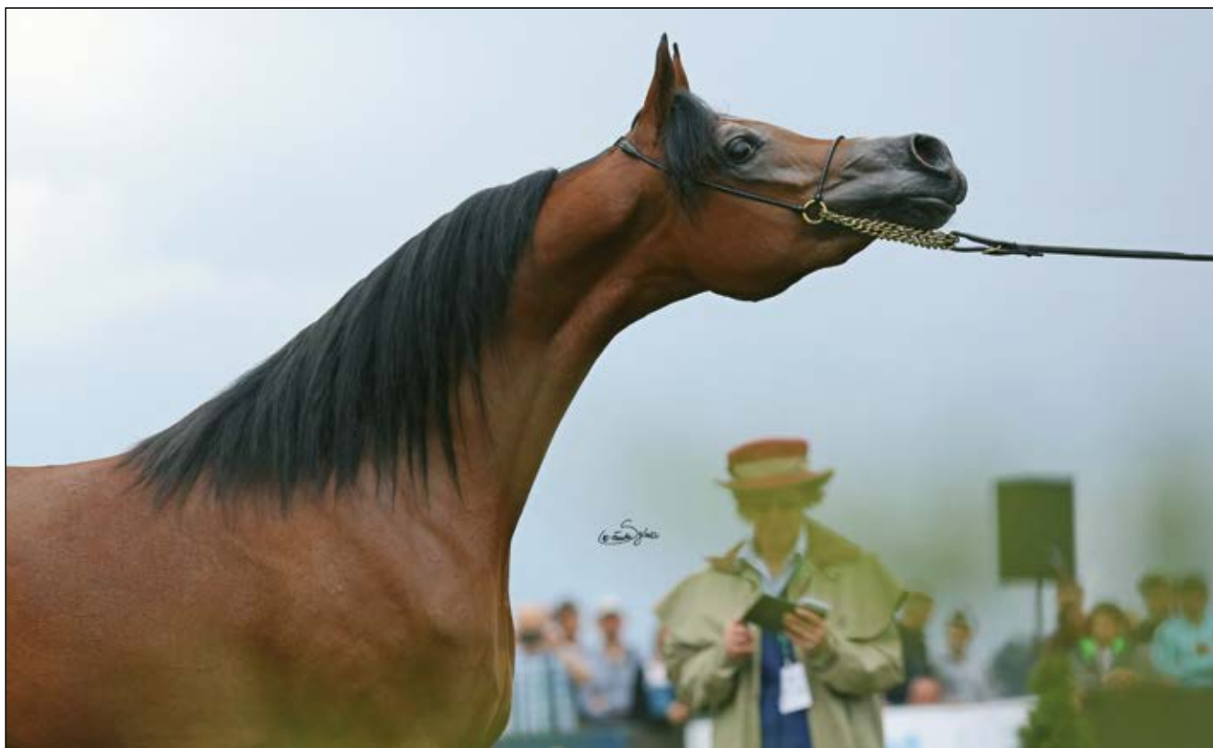
Pamina (Pogrom x Pianissima)

National Silver Champion Senior Stallion. In 2018, EQUATOR competed in the Middle East, winning silver medal in Dubai and gold medal in Sharjah. It is hard to find a more spectacular show career than the one of EQUATOR and his younger maternal half-sister, EL BELLISIMA 2017 (by Ascot DD 2011), stays in his shadow for now, having won 'just' three medals, two silvers and one bronze, at the Polish Nationals.