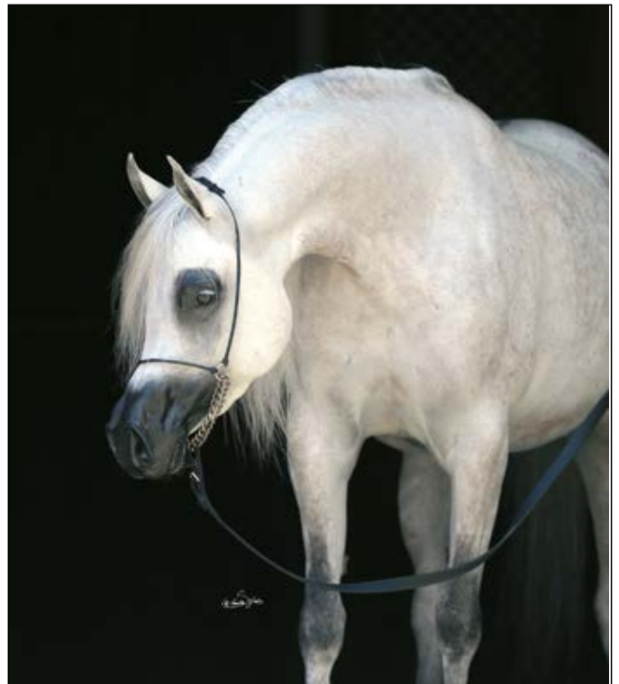
El Esmera (Sahm El Arab x Esmeraldia)