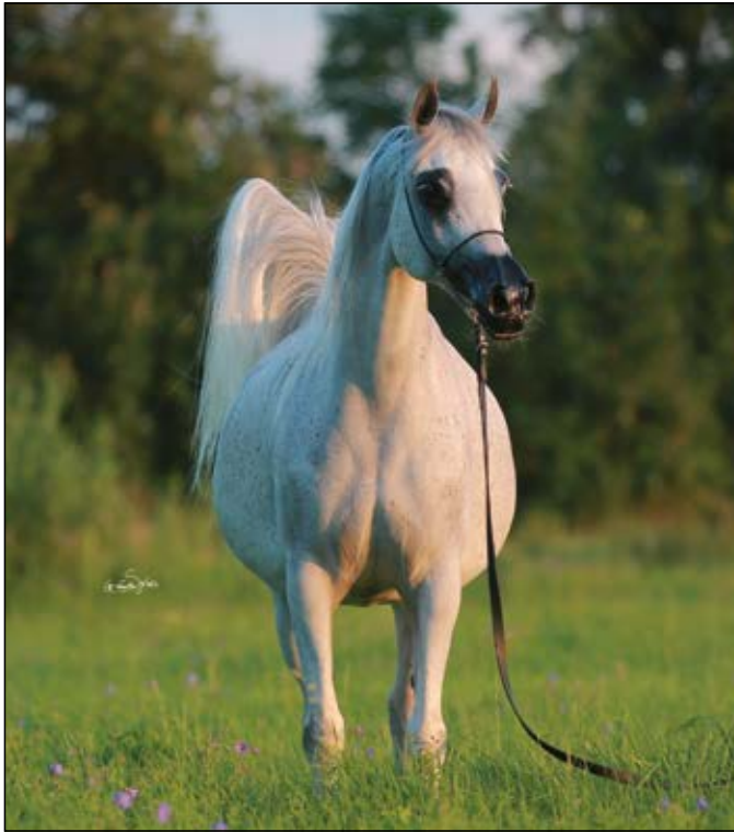
Emandorissa (Abha Qatar x Emanda)