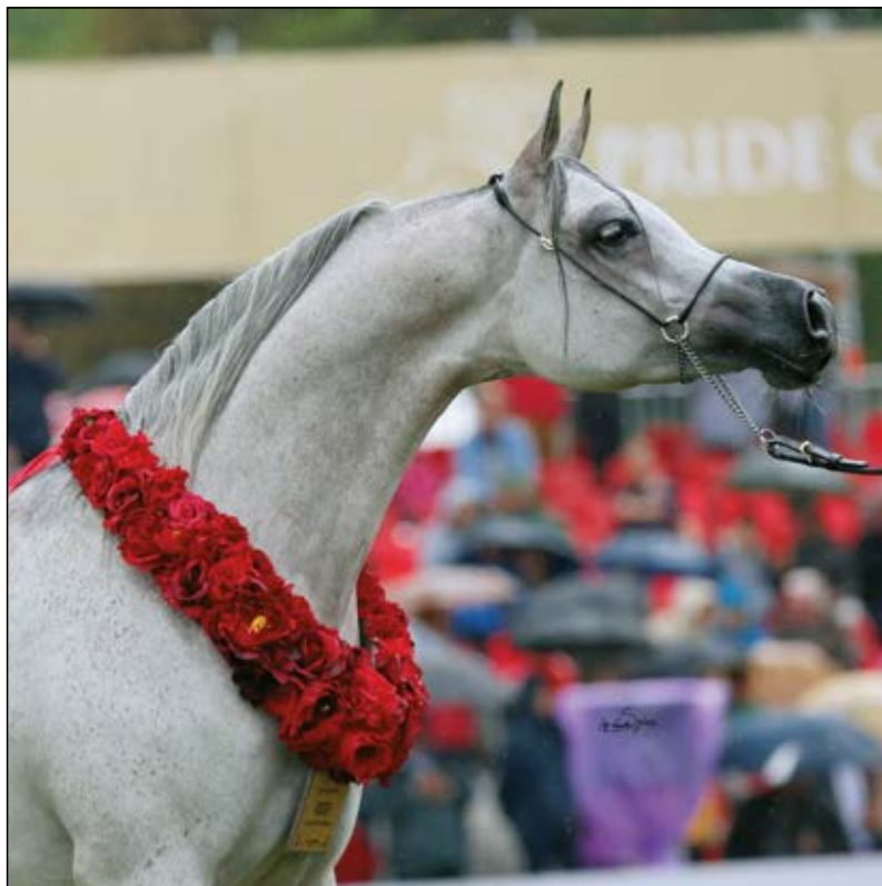
Perfinka (Esparto x Perfirka) - Janów Podlaski 2012

Senior Mare, 2019 Sharjah International Gold Champion Senior Mare, 2019 Dubai International Gold Champion Senior Mare, 2019 Gold Champion Senior Mare at King Abdulaziz Arabian Horse Centre Show and 2020 Gold Champion Senior Mare at Prince Sultan Bin Abdulaziz International Arabian Horse Festival. PEPITA's son PITAWAL 2013 (by Kahil Al Shaqab) has had a pretty impressive show career himself, also winning several titles: 2014 Białka Junior Spring Show Silver Champion Yearling Colt, 2014 Polish National Silver Champion Junior Colt, 2015 Białka Junior Spring Show Bronze Champion Junior Colt, 2015 Prague InterCup Bronze Champion Junior Colt, 2019 Polish National Silver Champion Senior Stallion and 2021 Silver