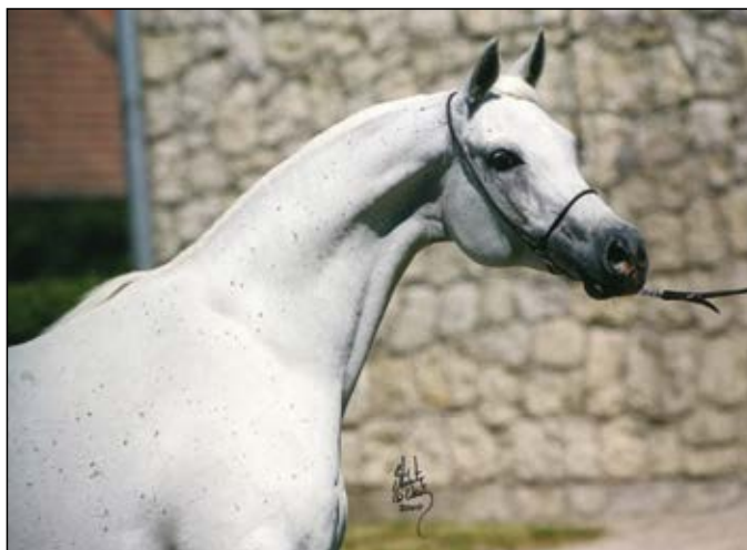
Emanacja (Eukaliptus x Emigracja)