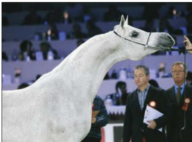
El Dorada (Sanadik El Shaklan x Emigrantka) - Paris 2011