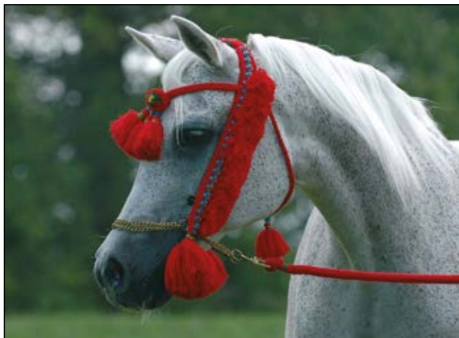
Emigracja at the age of 26