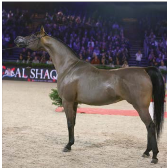
Pianissima (Gazal Al Shaqab x Pianosa) - Paris 2013