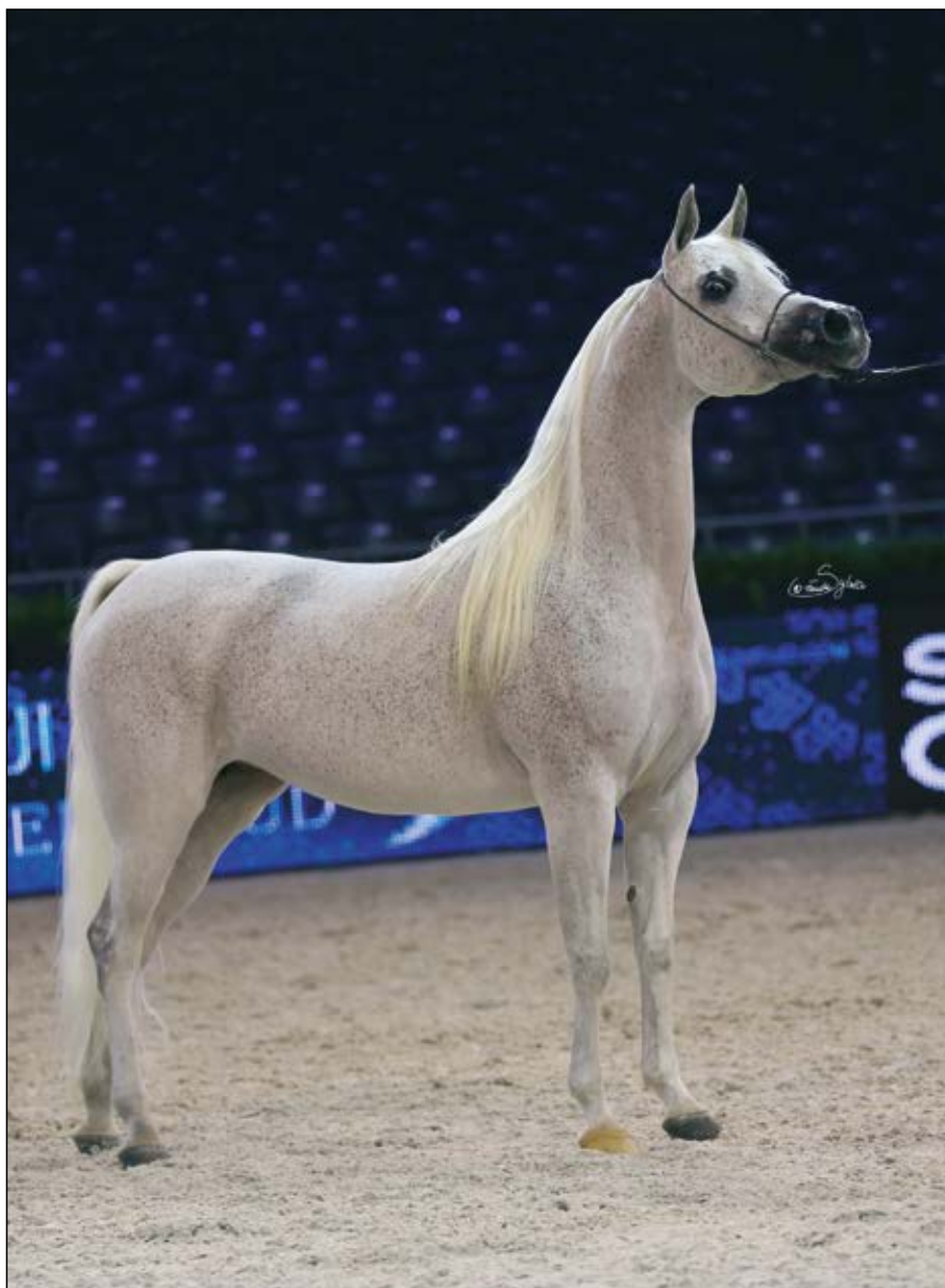
Emandoria (Gazal Al Shaqab x Emanda) - Paris 2013

that surpassed EL DORADA's accomplishments in the showring, as she stood on the podium of most prestigious shows not once but several times. In Europe, as a junior filly, she was named 2005 and 2006 Polish National Reserve Champion, 2005 European Reserve Champion, 2005 World Champion and 2006 European