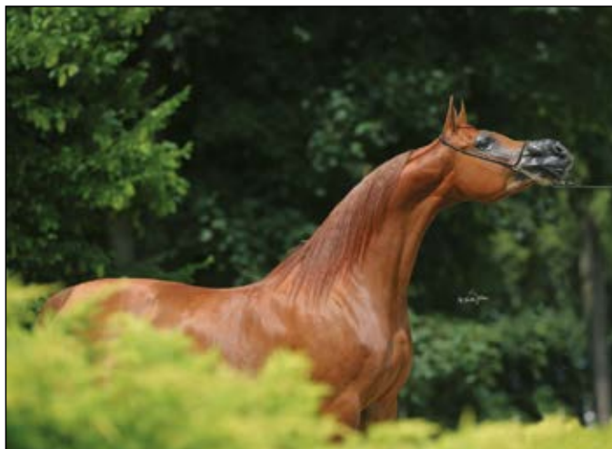
Paterna (Eden C x Pinga)