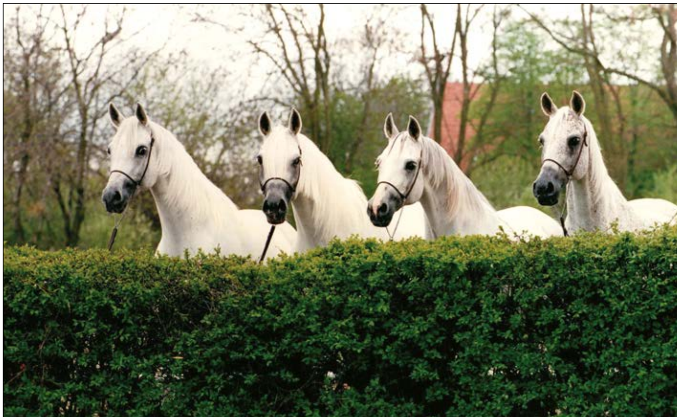
Emilda, Emanacja, Emigrantka, Emigracja

Junior Filly, 1998 All Nations Cup Champion Senior Mare as well as 1999 Polish National Champion Senior Mare and Best in Show, EMANACJA blessed Michałów with some outstanding offspring. Like her dam, she was the mother of mares. Her firstborn filly EMILDA 1990 (by Pamir 1984) was 1992 Polish National Champion Junior Filly, 1996 and 1997 Polish National Reserve Champion Senior Mare, 1999 All Nations Cup Reserve Champion Senior Mare and 2000 UK National Champion Senior Mare. Before being sold to Halsdon Arabians in 1998 for 200 000 USD, EMILDA left in Michałów two extraordinary grey fillies by MONOGRAMM 1985, EMBRA 1995 and EMMONA 1998. EMBRA, the 2009