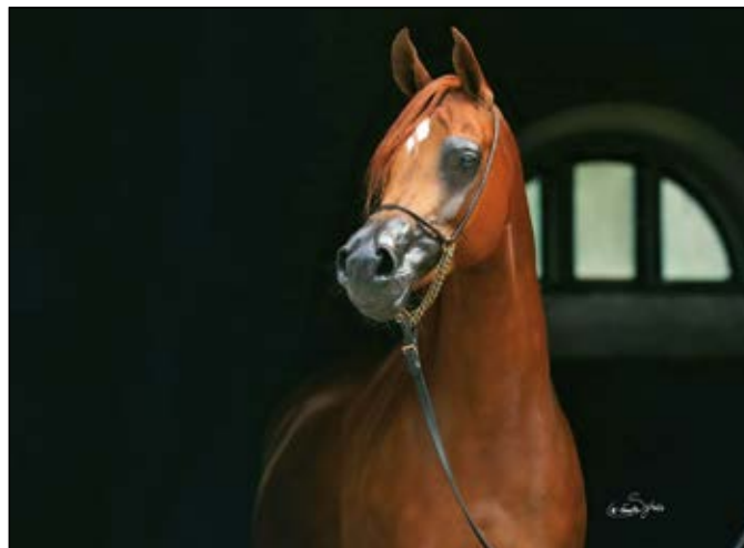
Paterna (Eden C x Pinga)