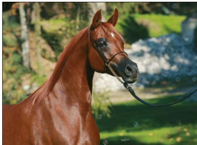
Palatina (QR Marc x Palmeta)