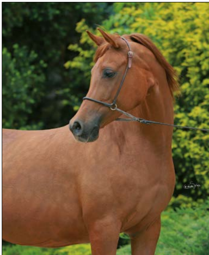
Ekliptyka (Ekstern x Ekspozycja)