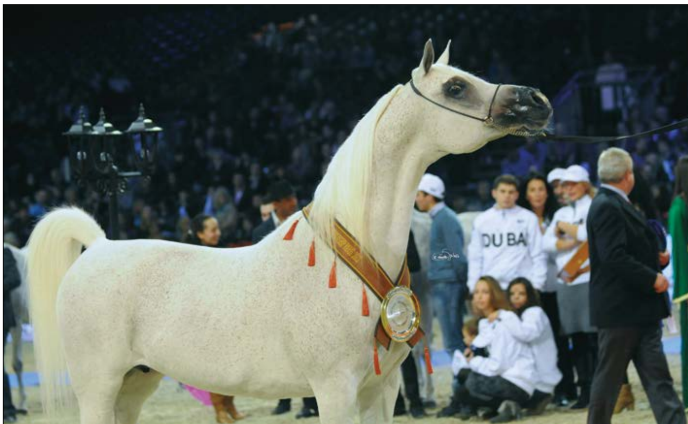
El Dorada (Sanadik El Shaklan x Emigrantka) - Paris 2012.

Reserve Champion Senior Stallion, 2001 European Champion Senior Stallion and 2002 Polish National Champion Senior Stallion, as well as an equally celebrated mare, EL DORADA 1998 (by Sanadik El Shaklan 1983), whose countless titles include: 2000 Polish National Champion Junior Filly, 2000 European Champion Junior Filly, 2002 Polish National Champion Senior Mare, 2002 All Nations Cup Champion Senior Mare, 2002 European Reserve Champion Senior Mare, 2004 European Champion Senior Mare, 2004 World Reserve Champion Senior Mare, 2006 Scottsdale Reserve Champion Senior Mare, 2006 US National Champion Senior Mare, 2012 All Nations Cup Silver Champion Senior Mare, 2012