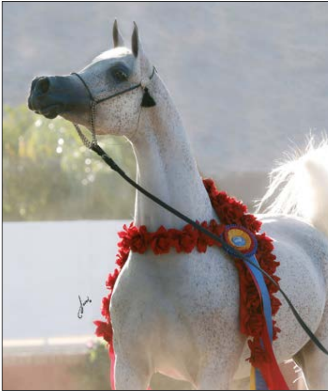
Perfinka (Esparto x Perfirka)