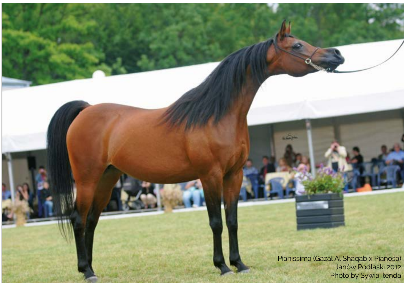
Pianissima (Gazal Al Shaqab x Pianosa) Janów Podlaski 2012