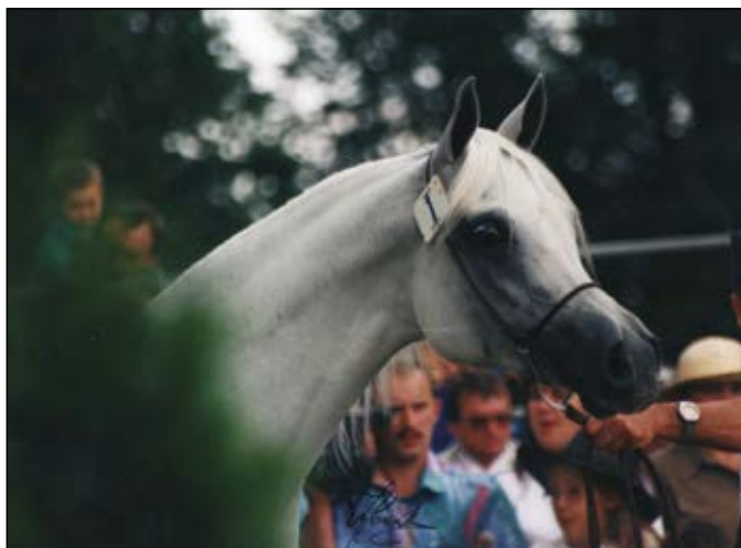
Emilda (Pamir x Emanacja)