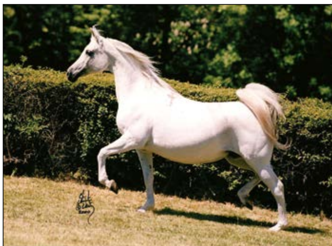
Emigrantka (Eukaliptus x Emigracja)