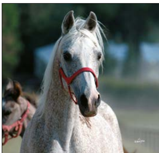
Perforacja (Ernal x Pentoza)