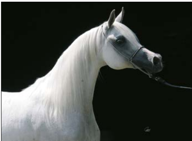
Emira (Laheeb x Embra)