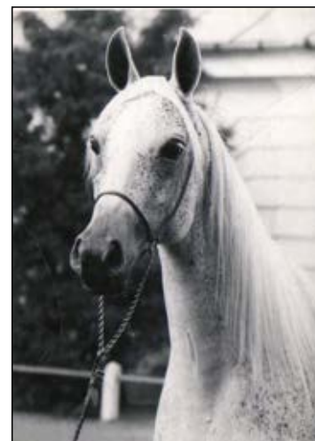
Emisja (Carycyn x Espada)