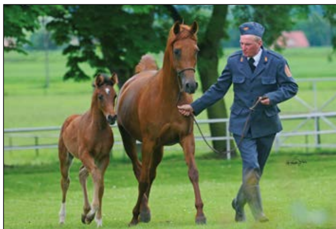
Ekliptyka with Equator

Another crossing of EUKALIPTUS with EMIGRACJA produced the fabulous ERLANDA 1990, 1994 International Champion Senior Mare and Best in Show in Babolna as well as 1995 Polish National Reserve Champion Senior Mare. Her only progeny was the painting-like precious ELANDRA 1995 (by Monogramm), sold to the USA for the record price of the 2005 Pride of Poland auction, 290 000 EUR. She surely made her new owner happy by becoming Scottsdale Champion Senior Mare and US National Reserve Champion Senior Mare two years after the sale.