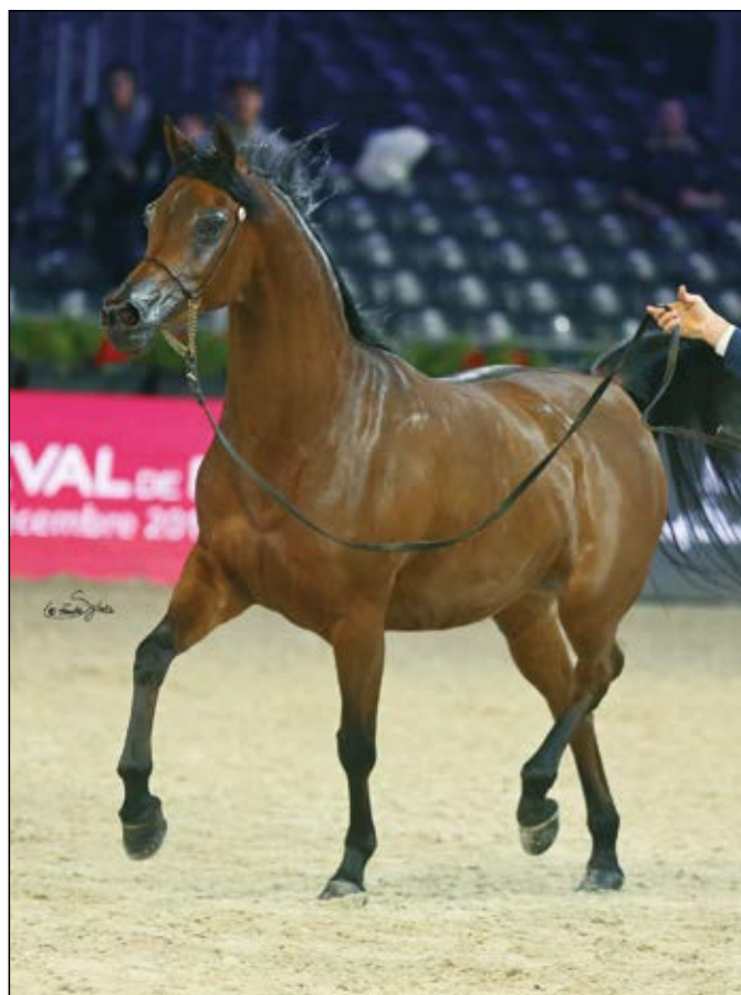
Pinga (Gazal Al Shaqab x Pilar) - Paris 2015