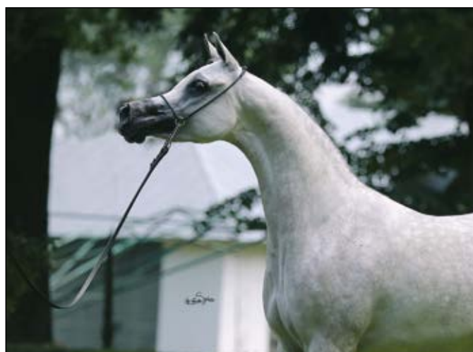
Pascuala (Ascot DD x Palmeta)