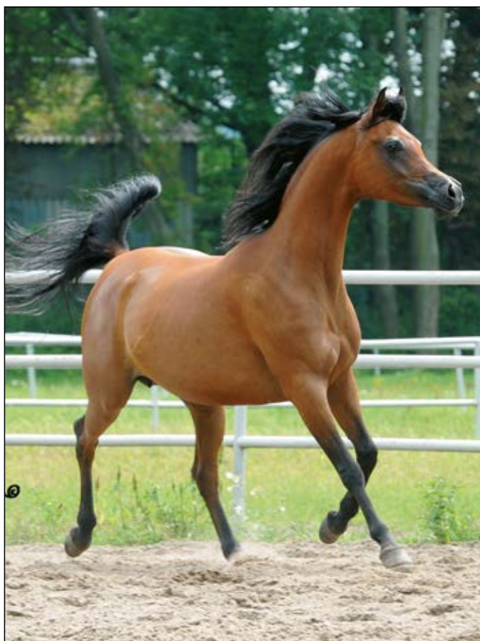
Pinga (Gazal Al Shaqab x Pilar)